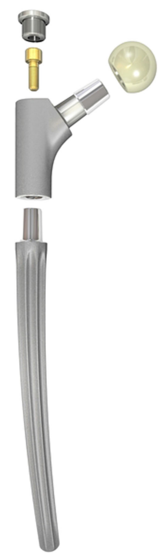
Fig. 1 The 200-mm curved MRP-TITAN stem (MRP-TITAN<sup>®</sup>; PETER BREHM, Weisendorf, Germany)

curved MRP-TITAN stem in a retrospective, monocentric and consecutive study.