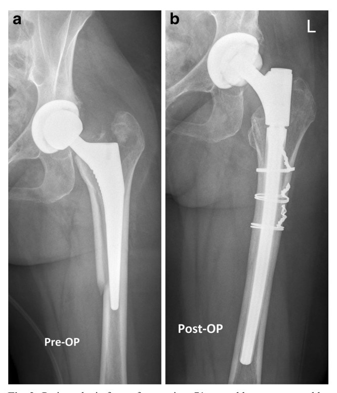
Fig. 2 Periprosthetic femur fracture in a 71-year-old woman treated by revision using a 200-mm curved MRP-TITAN stem and osteosynthesis with cerclages around the femur

with their results, 10.1 % were partly satisfied and only 1.5 % were not satisfied according to the patients' subjective satisfaction consideration.